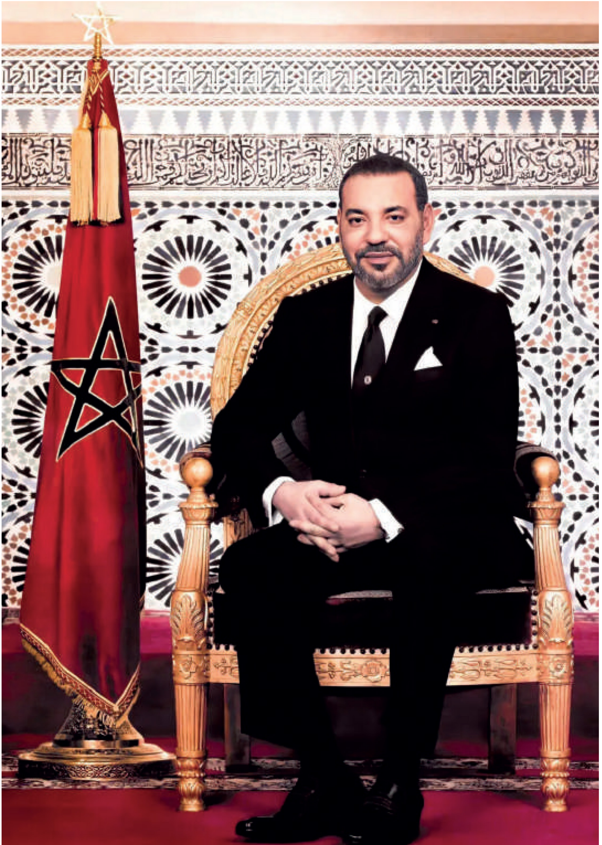
صَاحِبُ الْكِبَالَةِ الْمَلِكُ مُحَمَّدُ السَّادِسُ نَصْرُهُ اللهُ